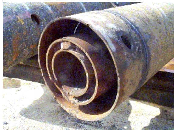
Multiple casings cut by SABRE